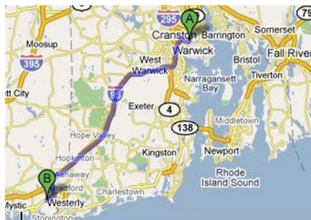
From (A) T.F. Green Airport, Prov. R.I. to (B) MSI